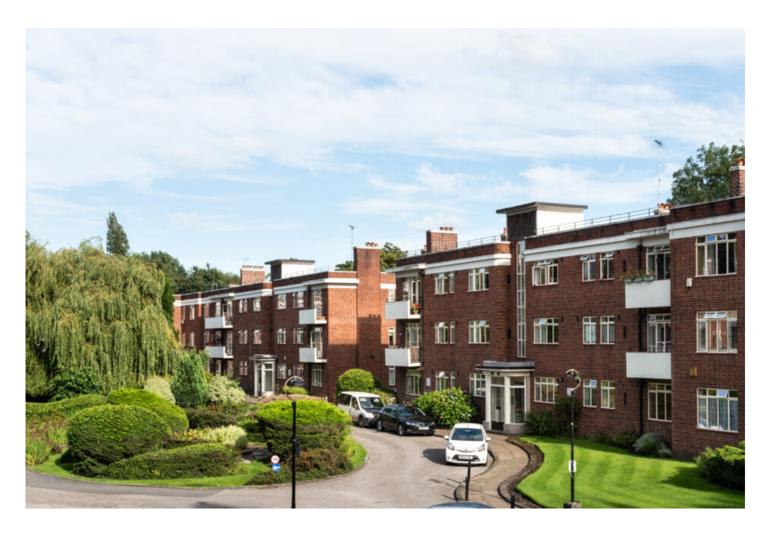
Wilmslow Road, Manchester Sold