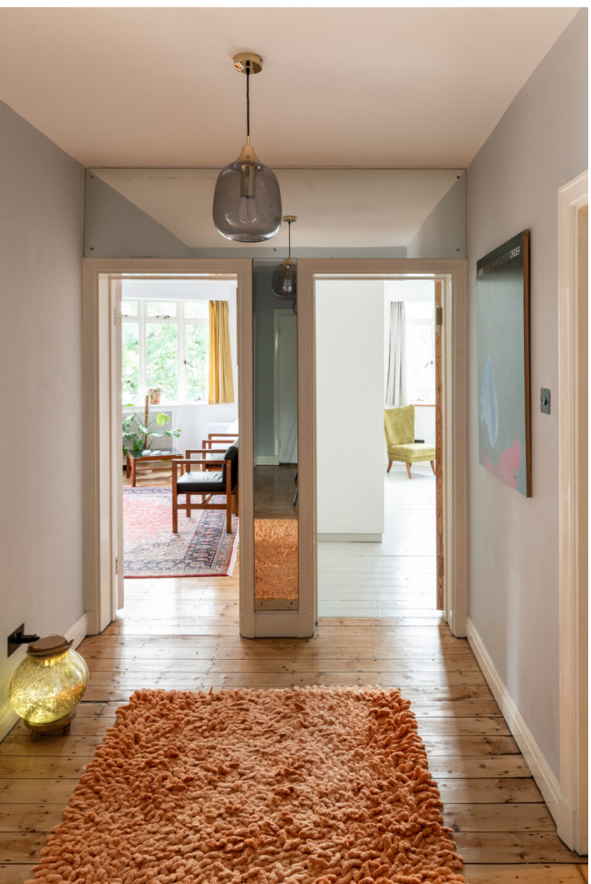
North England Sold