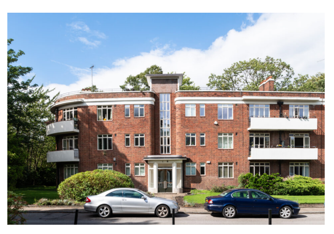
North England Sold