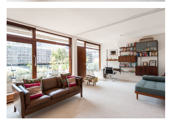
East London, London Sold