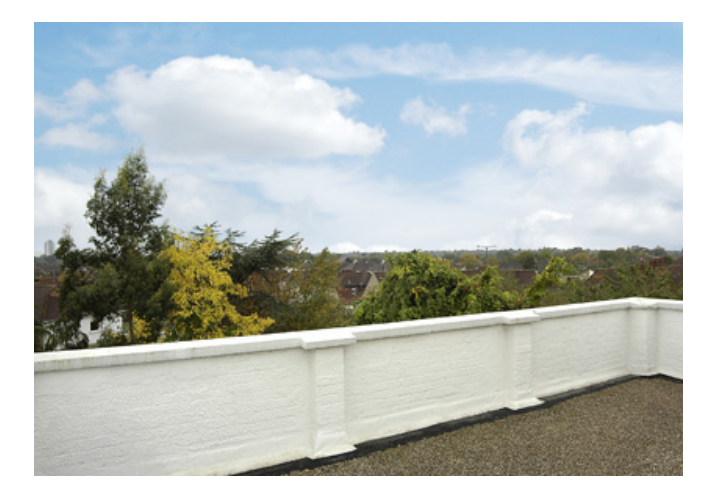
South-East England Sold