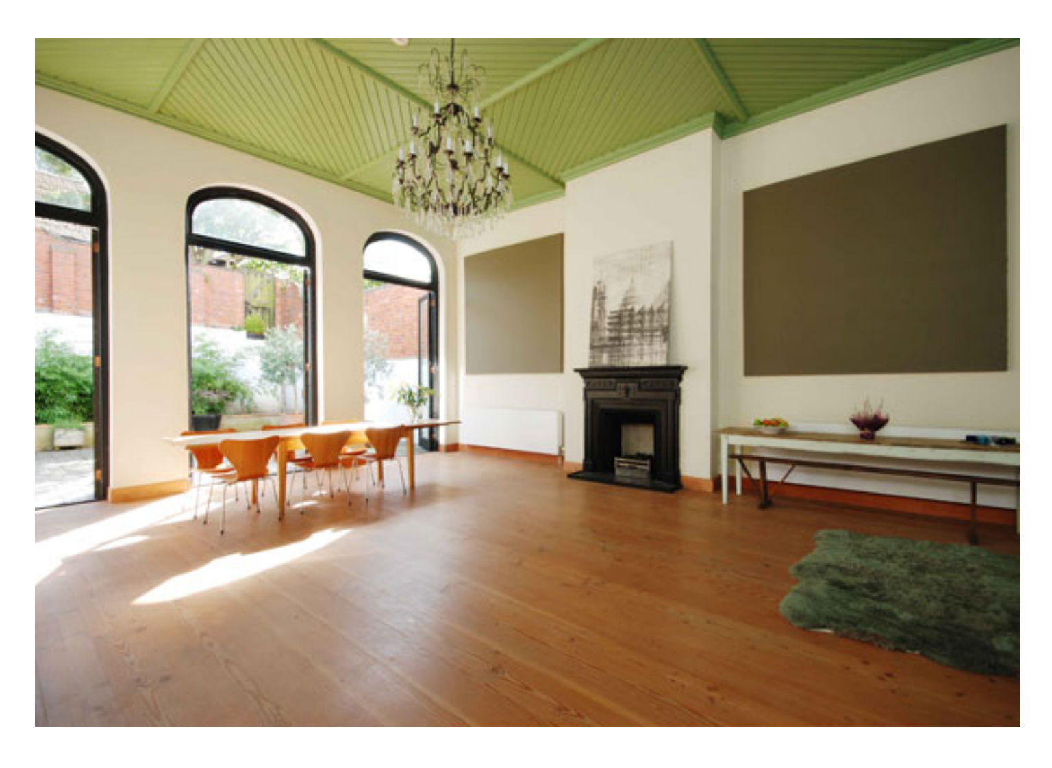
Hastings, East Sussex Sold