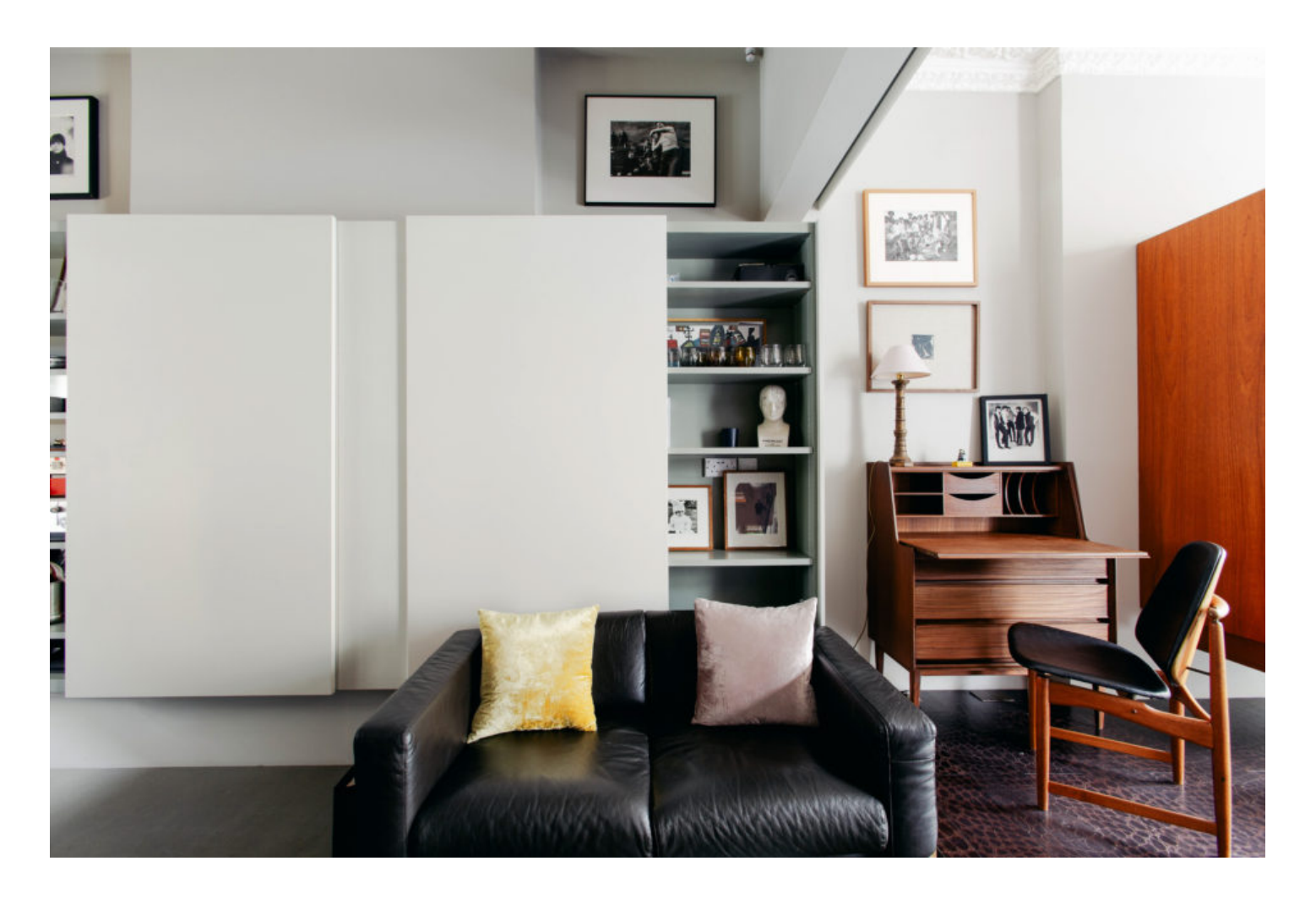
London SW1 £650,000 Share of Freehold