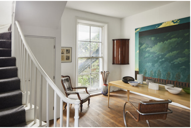
North London £3,595,000 Freehold