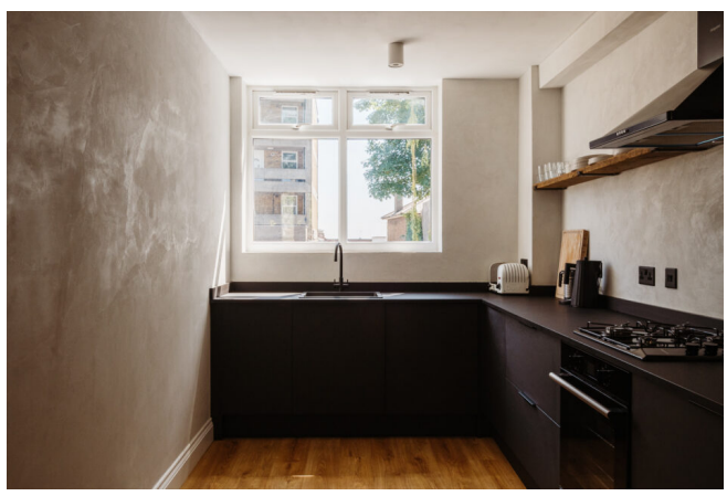
London, South London £750,000 Freehold