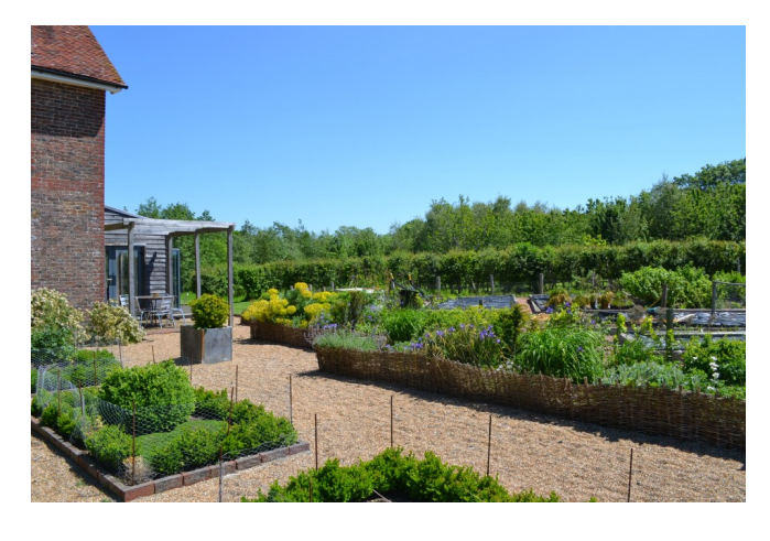
South-East England Sold