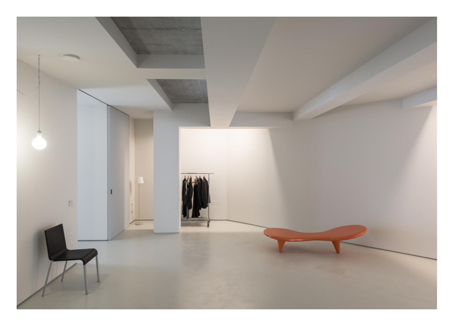
York Way, London N7 Sold