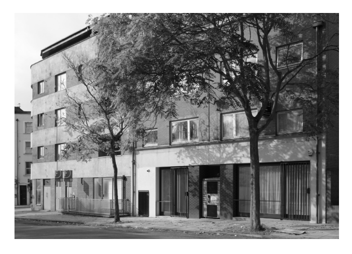
London, North London