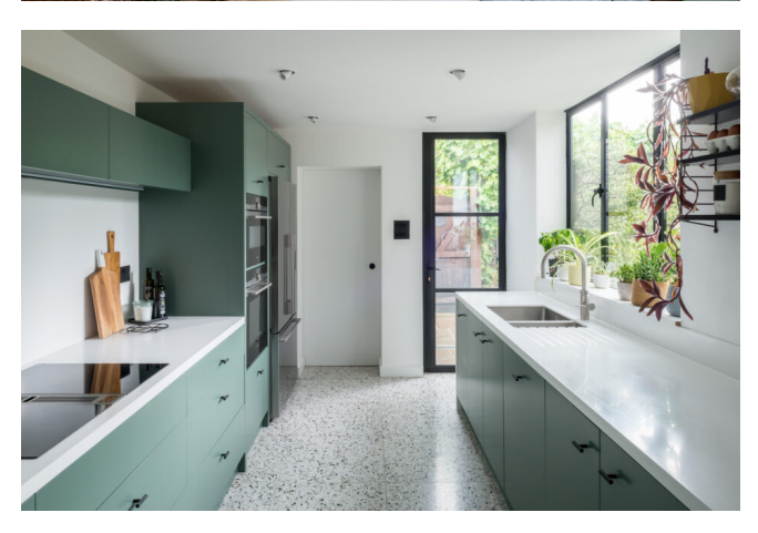
South-East England Sold