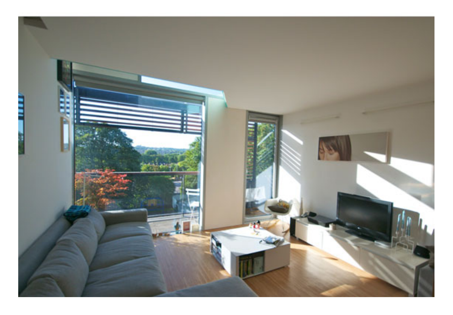
East Dulwich, London SE22 Sold