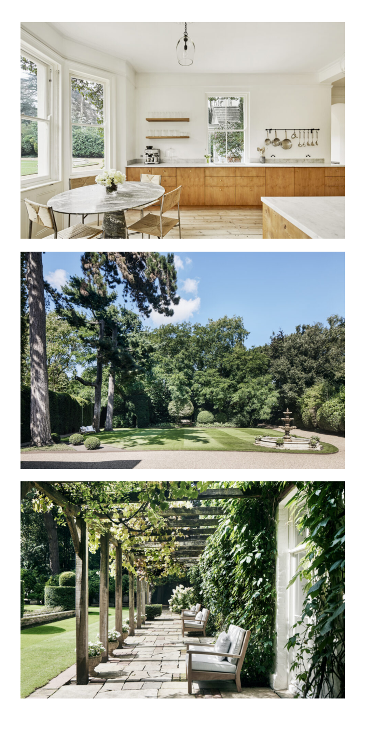
South–East England £6,500,000 Freehold