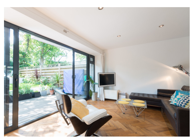
London, South London