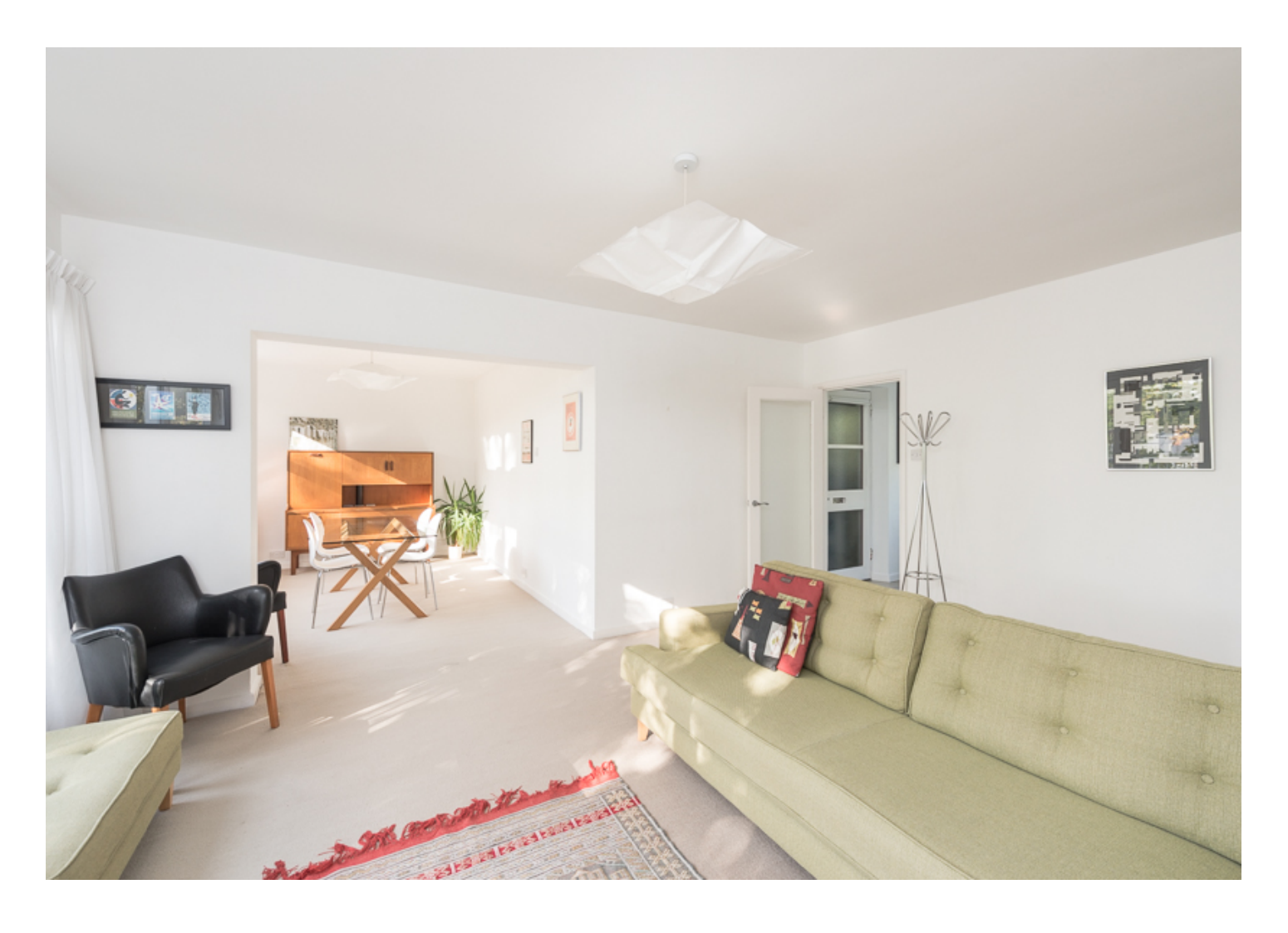
Blackheath Park, London SE3 Sold