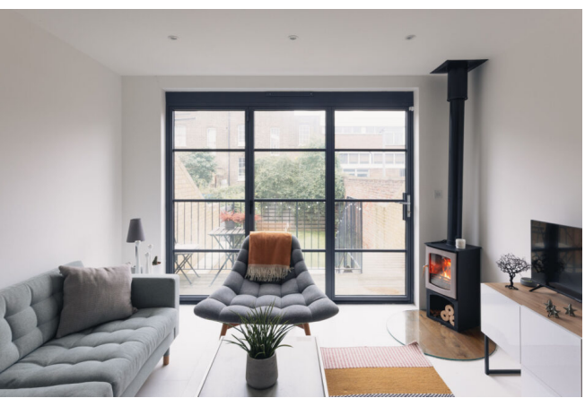
London, South London £950,000 Freehold