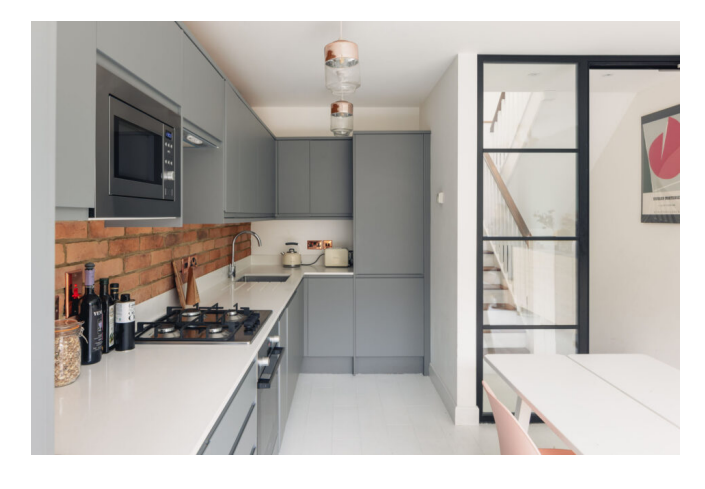
London, South London £950,000 Freehold