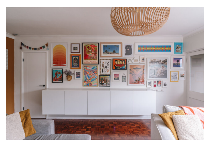
London, North London £550,000 Leasehold