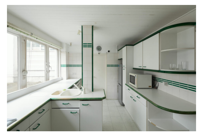
London, North London £925,000 Leasehold