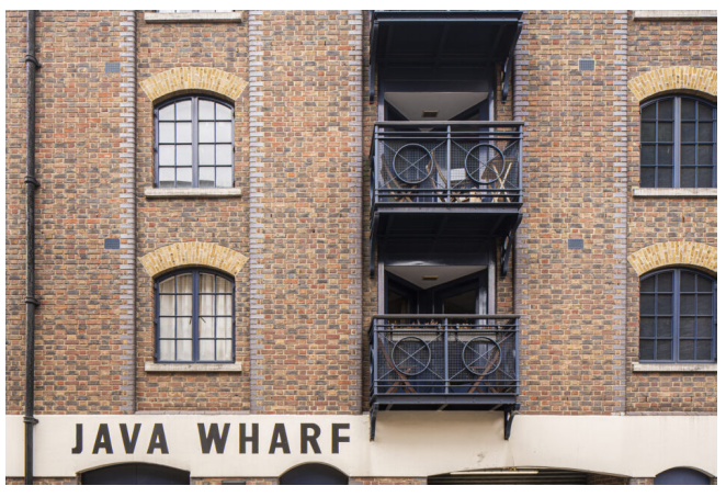
London, South London