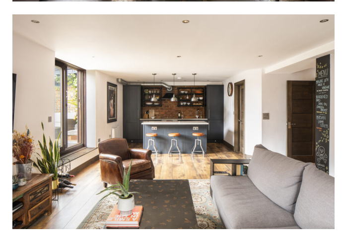
London, South London Sold