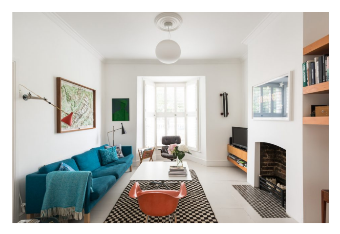
East London, London