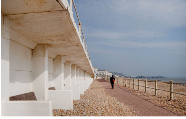
South–East England £175,000 Share of Freehold