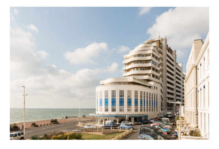
South–East England £175,000 Share of Freehold