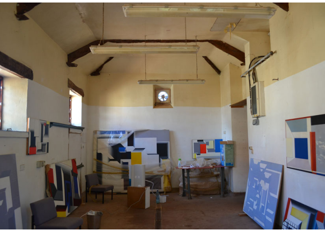
South-West England Sold