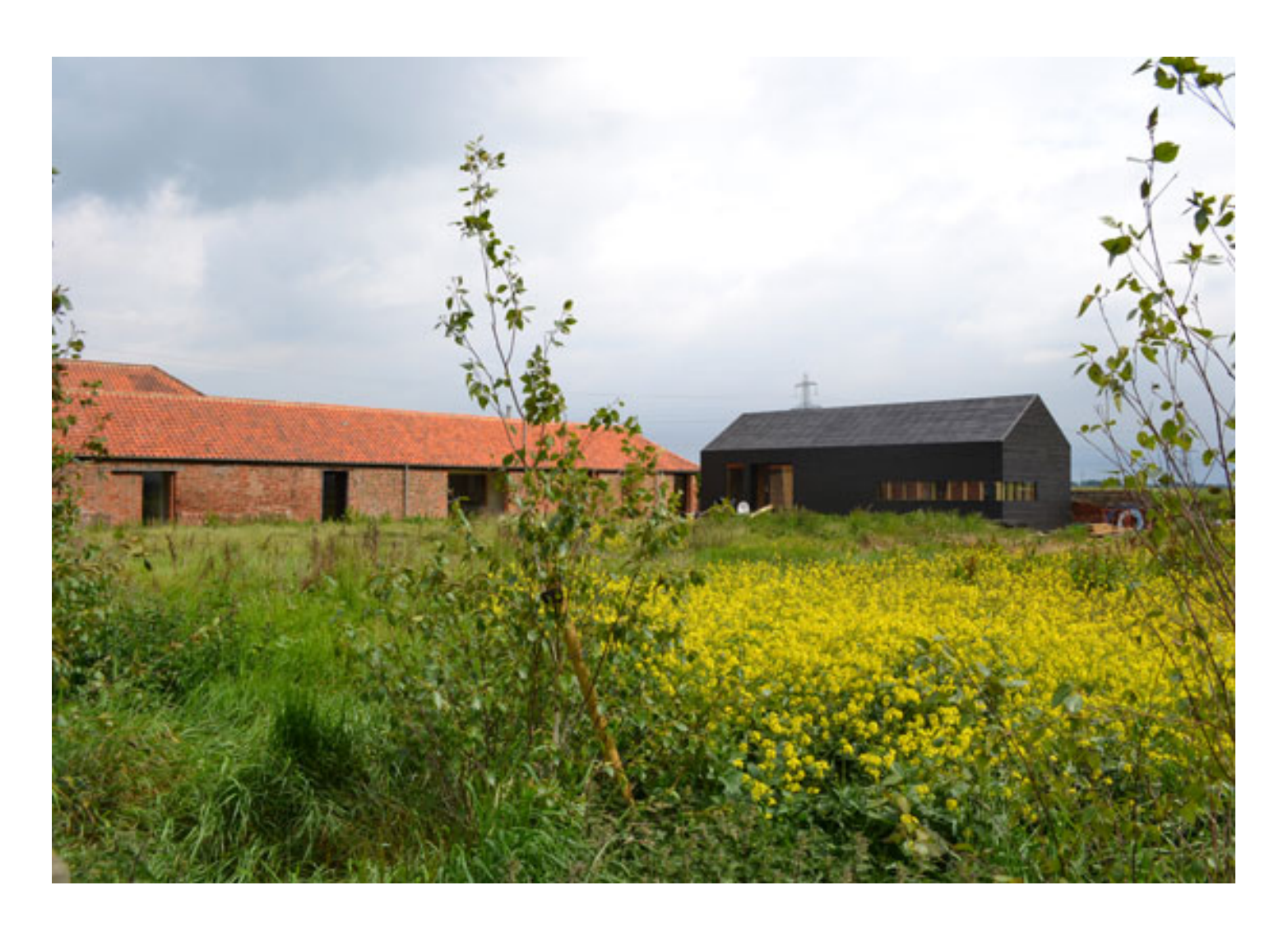
Walpole St. Peter, Norfolk Sold