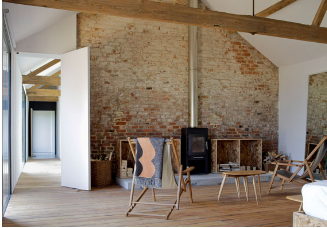
East Anglia Sold