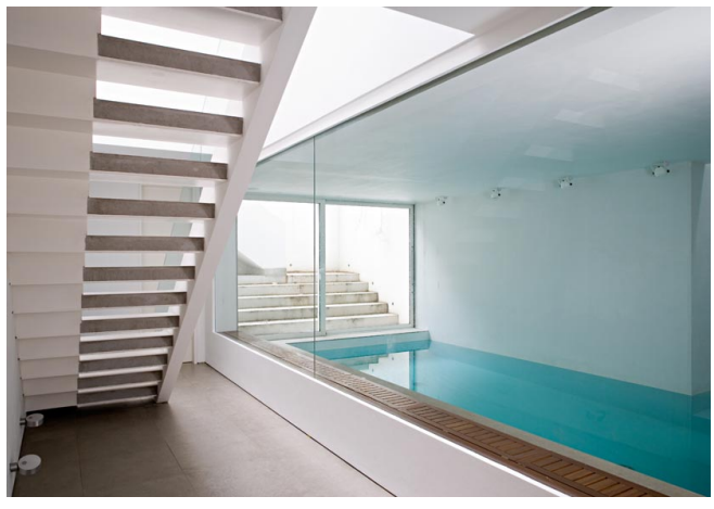
London, West London Sold