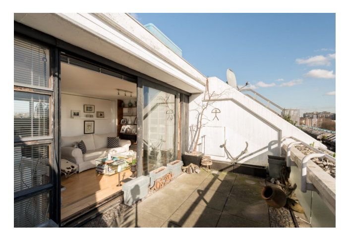
London, North London Sold