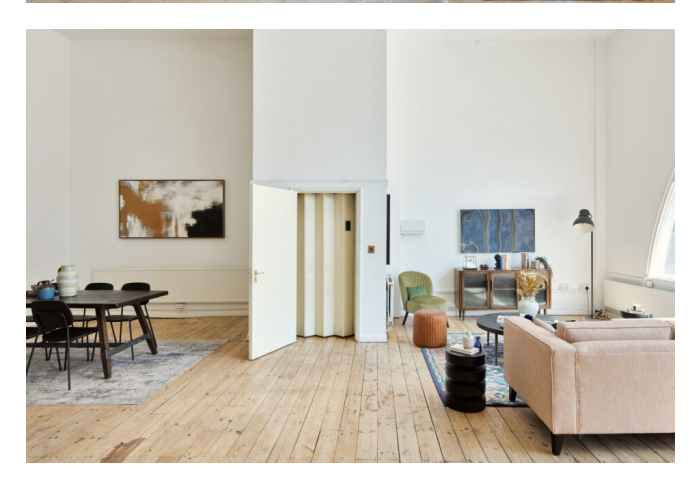
East London, London £1,695,000 Leasehold