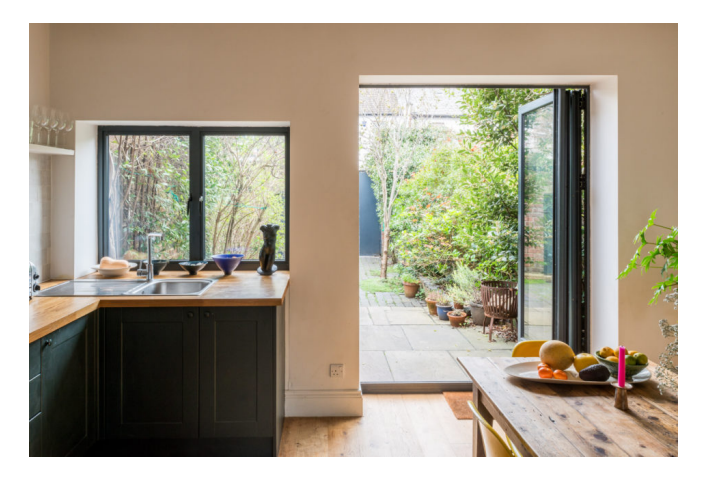
East Anglia, London, North London Sold