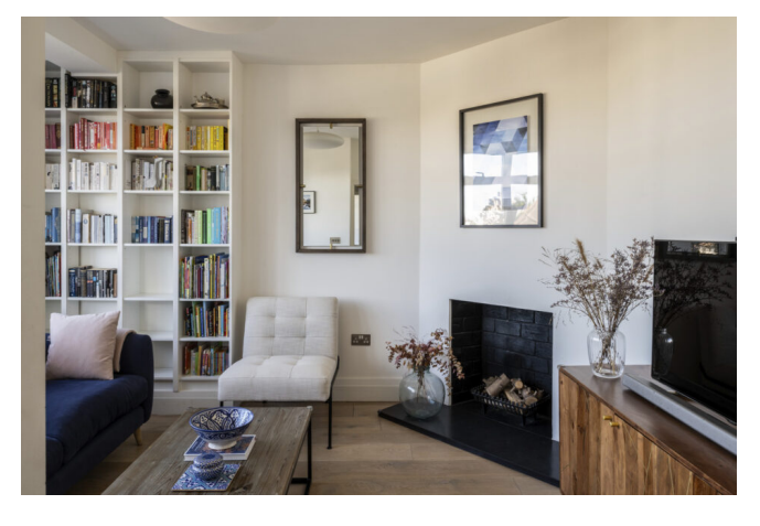
South London £1,425,000 Freehold