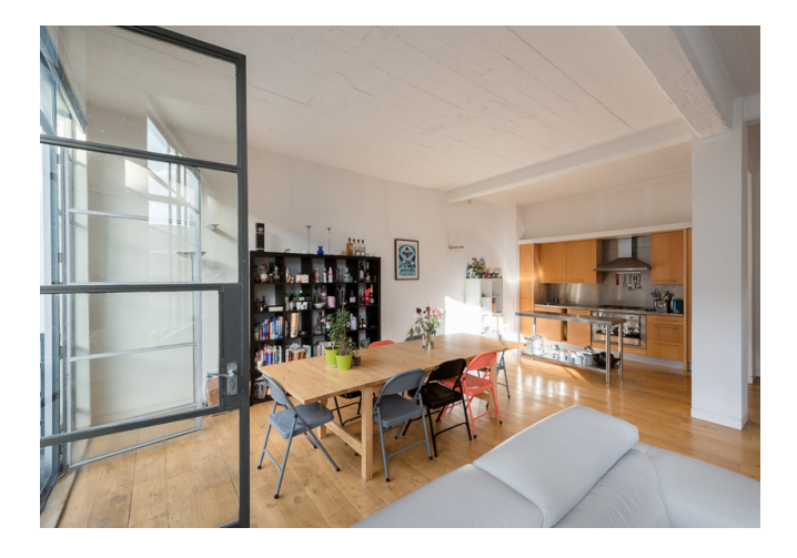
London, North London Sold