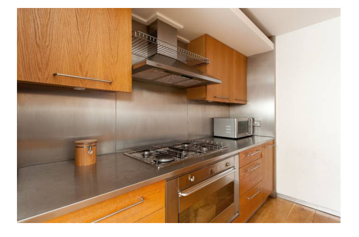
London, North London Sold