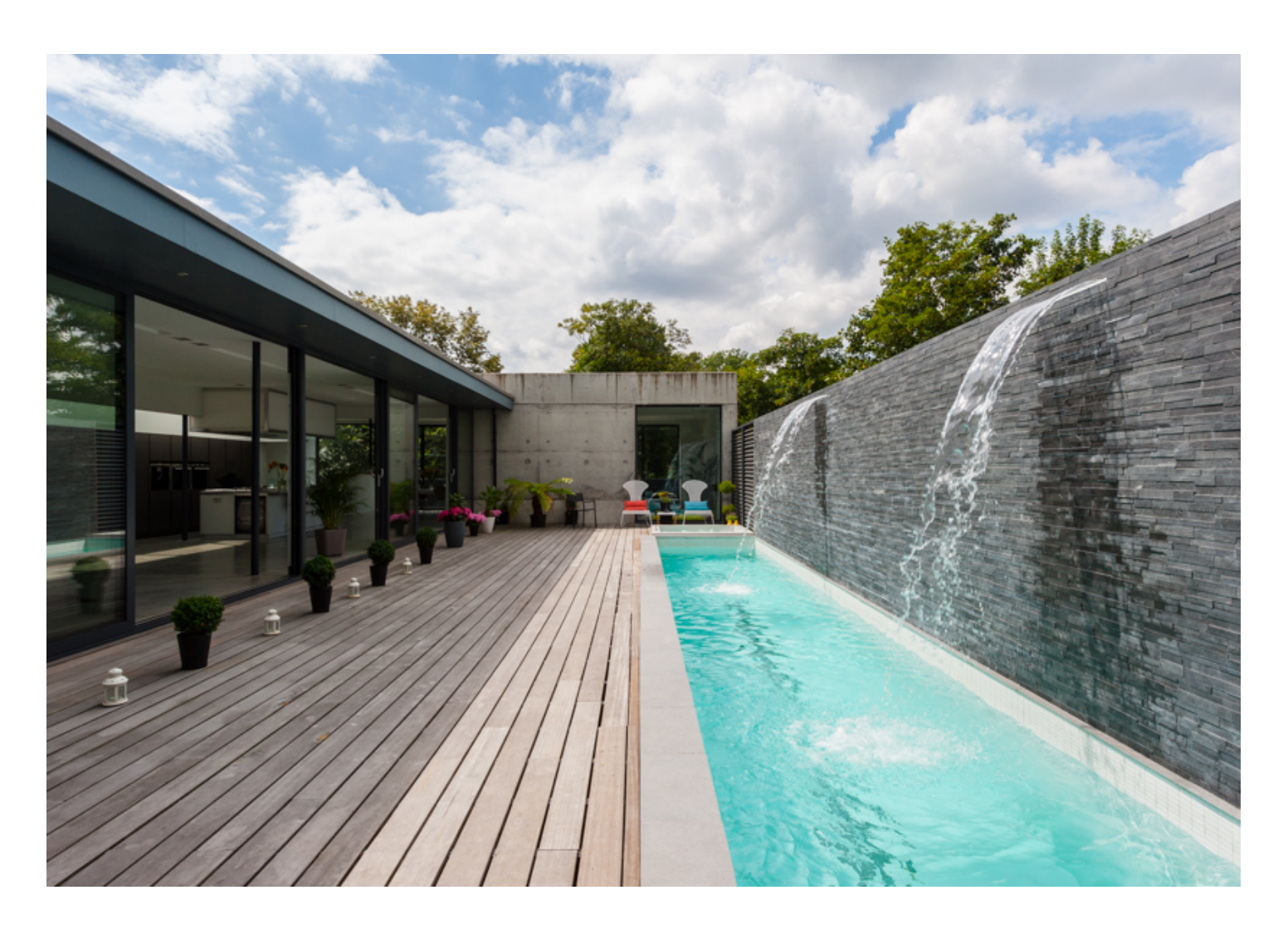
Highgate, London N6 Sold