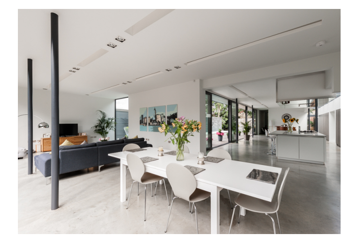
London, North London