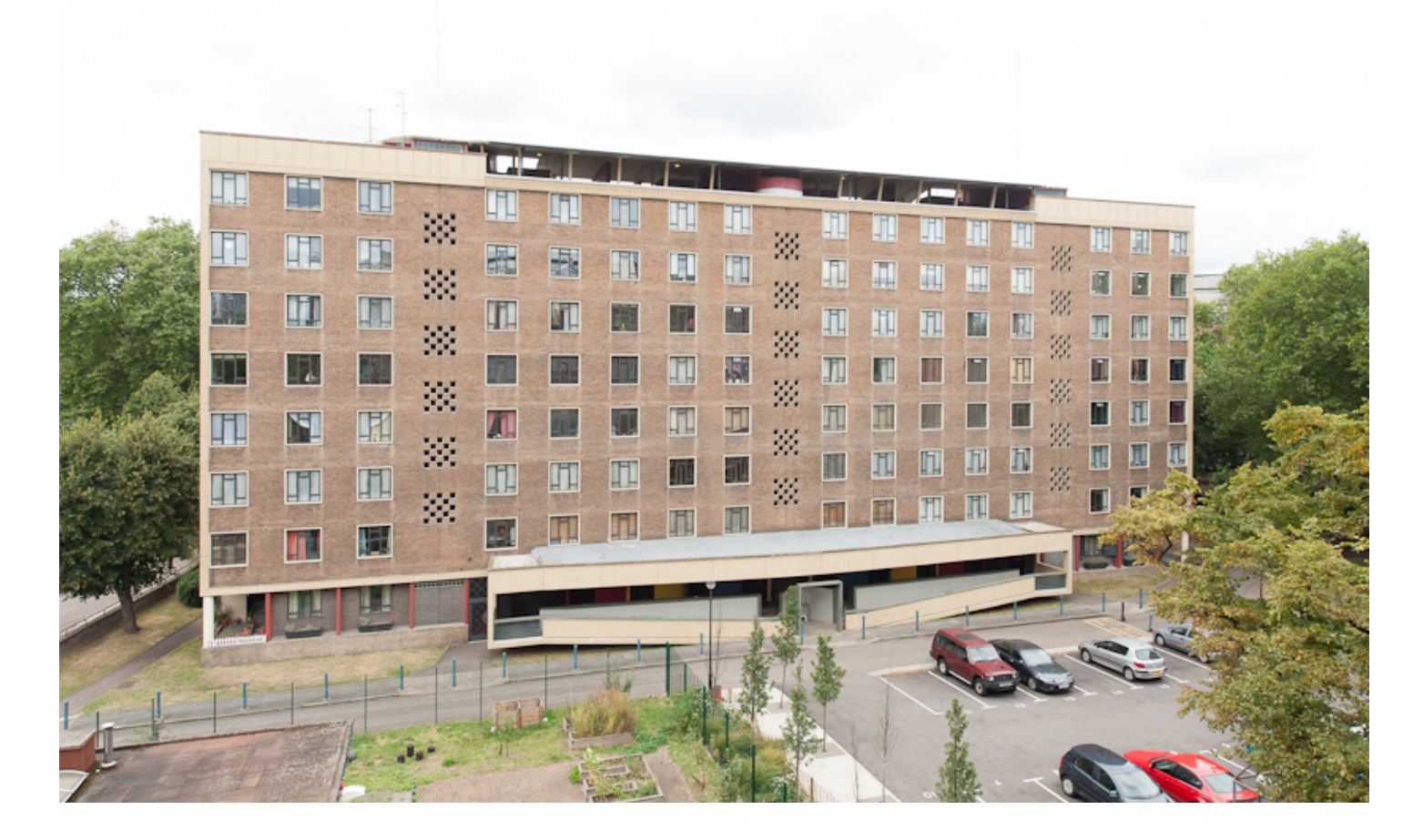
Rosebery Avenue, Spa Green Estate, London EC1 Sold