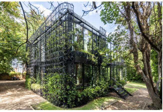
South-East England £1,500,000 Freehold