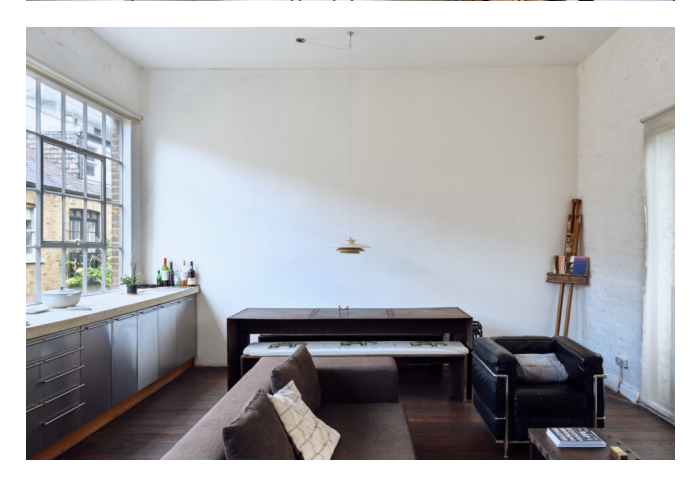
East London, London