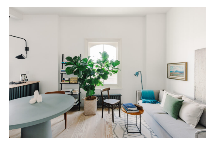
London, West London £499,000 Leasehold