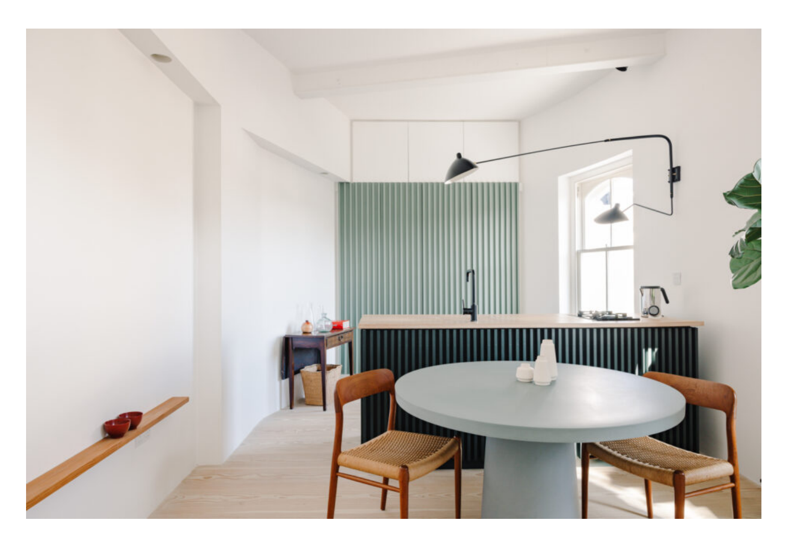
Walterton Road, London W9 £499,000 Leasehold