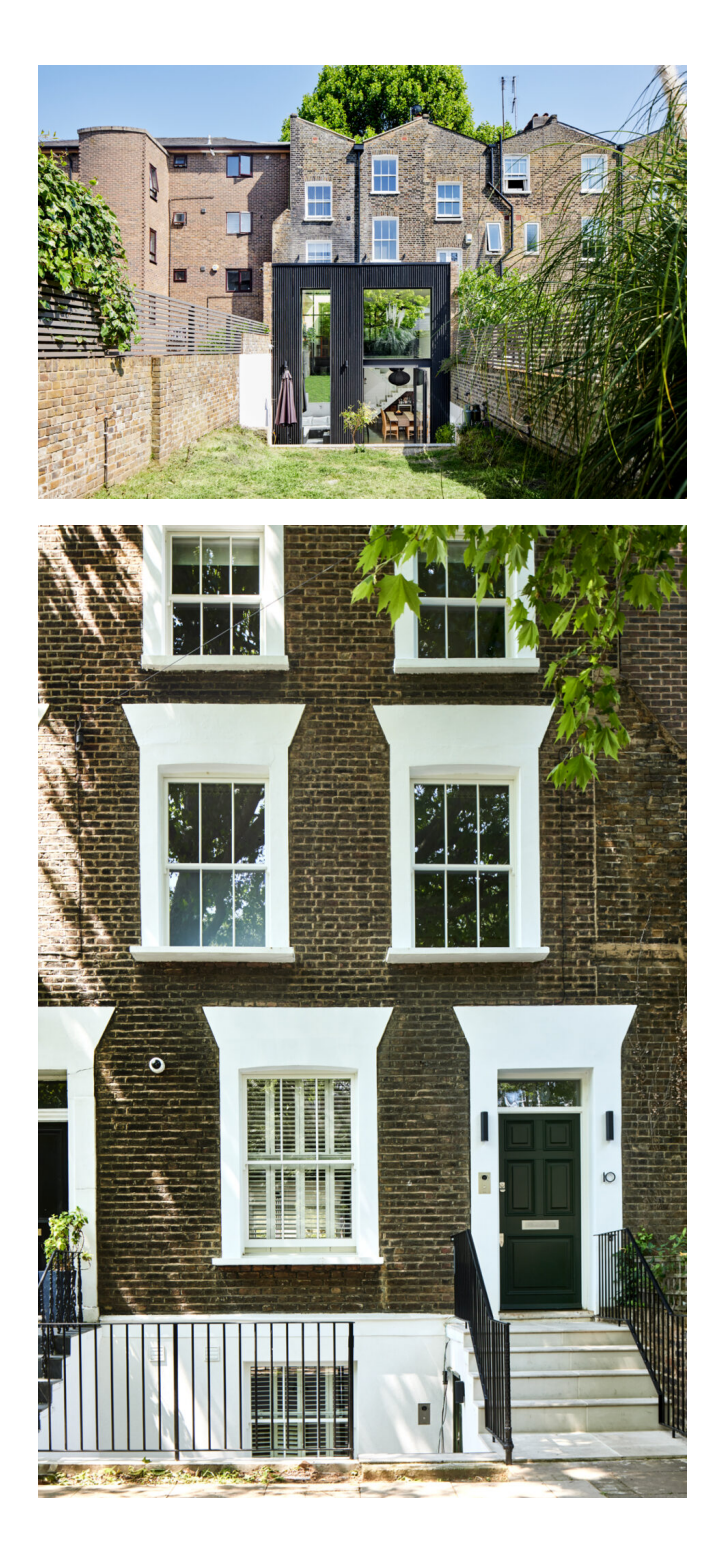
London, South London £2,750,000 Freehold