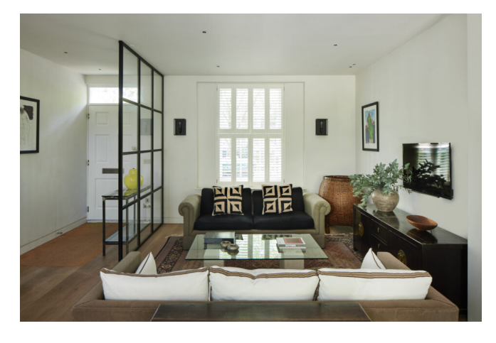
London, South London £2,750,000 Freehold